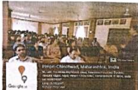
Interaction with Participants